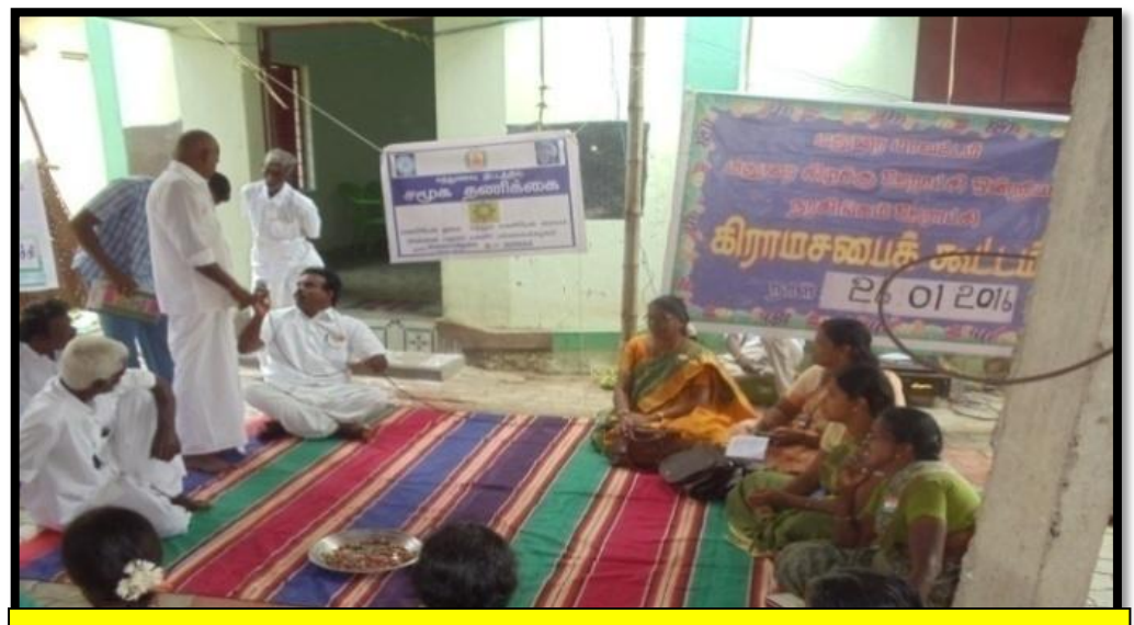
social audit project on mid day meal scheme in madurai district gram sabha meeting on 26th January, 2016