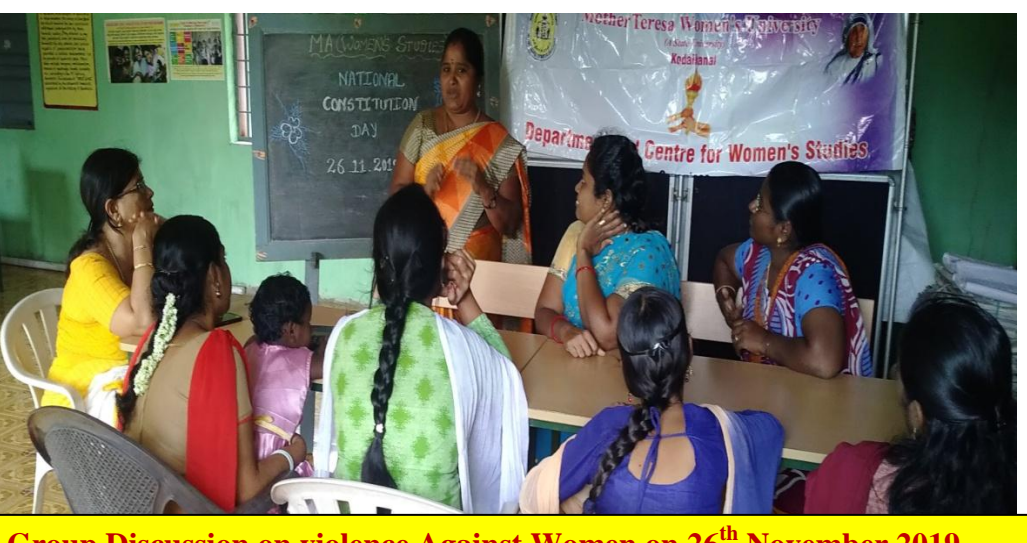
Group Discussion on violence Against Women on 26<sup>th</sup> November 2019