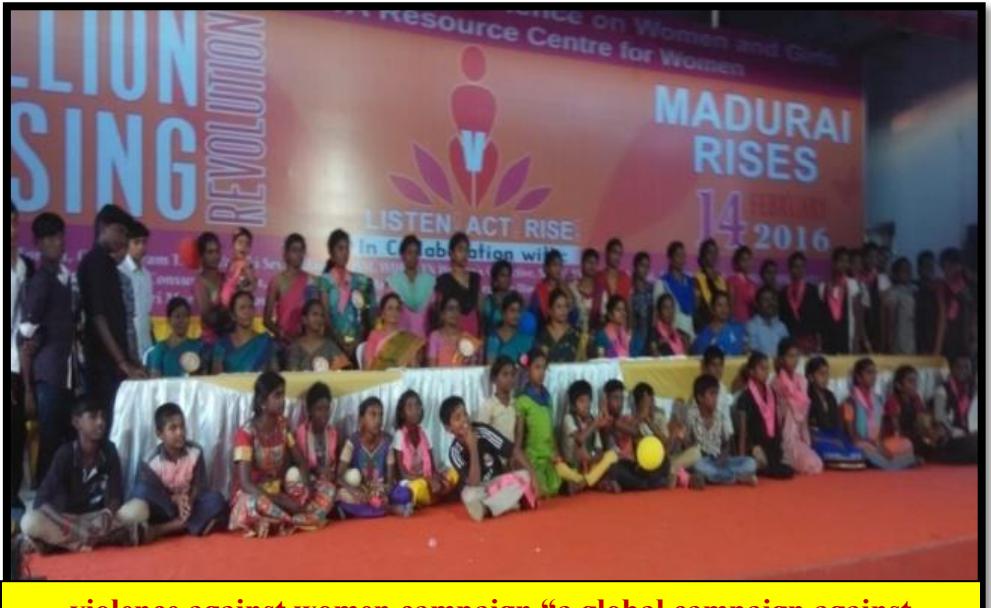
violence against women campaign "a global campaign against violence on women and girls" on February 2016